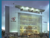
RMZ Westend - Pune 110,000 Sq.ft.