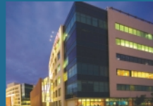
Ecospace - Bengaluru 2,000,000 Sq.ft.