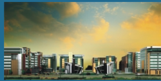
Ecospace - Kolkata 2,800,000 Sq.ft.