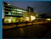
RMZ Centennial - Bengaluru 800,000 Sq.ft.