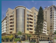
Millenia - Bengaluru 625,000 Sq.ft.