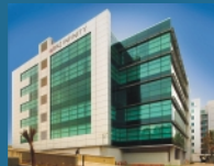
RMZ Infinity - Bengaluru 1,200,000 Sq.ft.