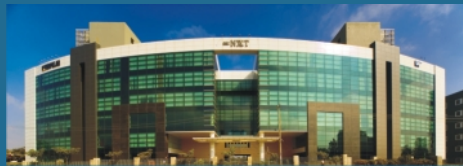
RMZ NXT - Bengaluru 750,000 Sq.ft.